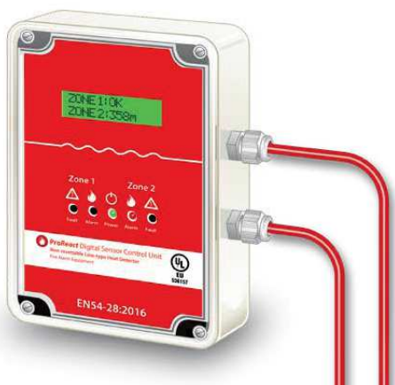
ProReact Digital Sensor Control Unit (DSCU-EN)

Thermocable's ProReact Digital Sensor Control Unit (DSCU-EN) is an EN54 certified dual zone alarm point distance locating module that is compatible with the ProReact EN Digital LHD range of cables. It can monitor up to 2,000 metres (6,562 ft) across two zones of digital LHD cable. It contains the popular interlock detection mode from the ProReact Digital Interface Monitor Module (DiMM) that reduces the possibility of false alarms.