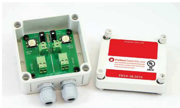
ProReact Digital End of Line Unit (EOLU-EN)

Thermocable's ProReact Digital end of line unit with test facility has also been certified to EN54-28:2016 and enables users to undertake hassle-free functional testing of the system. Users can verify normal conditions, trouble and alarm functions of a system by simulating a break in the cable or overheat condition.