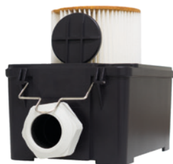
DFU 911S dust filter unit with integrated protective flap