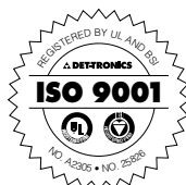
Wiring Terminal Identification for Standard X5200