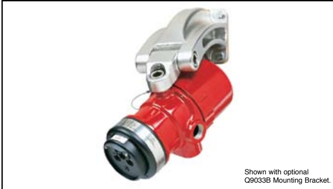
Shown with optional Q9033B Mounting Bracket.