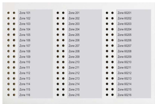
LED Display Field LAF648-1

can be easily integrated into the control panel, thereby ensuring space-saving and orderly arrangement without external cabling. The additional devices are parameterised together with the control panel by means of the PC software PARSOFT.