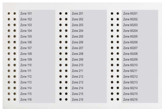
LED Display Field LAF648-1

can be easily integrated into the control panel, thereby ensuring space-saving and orderly arrangement without external cabling. The additional devices are parameterised together with the control panel by means of the PC software PARSOFT.